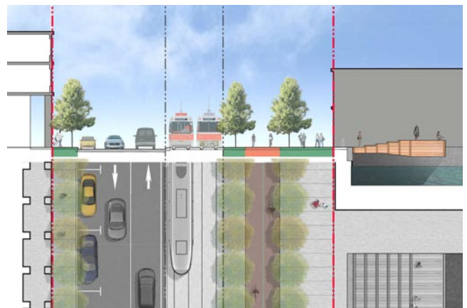
Alternative 5: Southside Transit with Expanded Public Realm and Two-Way Operations Through lanes northside for two-way traffic operations, Martin Goodman Trail southside