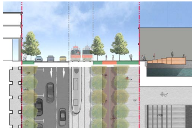
Alternative 4: Southside Transit with Expanded Public Realm and One-Way Operations Through lanes northside for one-way traffic operations, Martin Goodman Trail southside