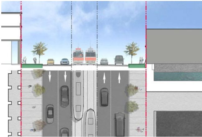
Alternative 1: Do Nothing (for Comparison Only) Maintain existing conditions