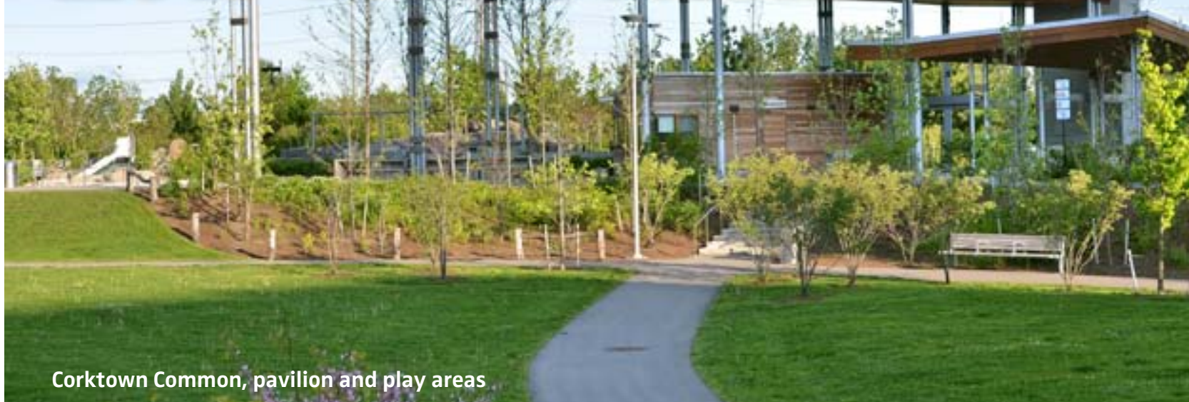
Corktown Common, pavilion and play areas