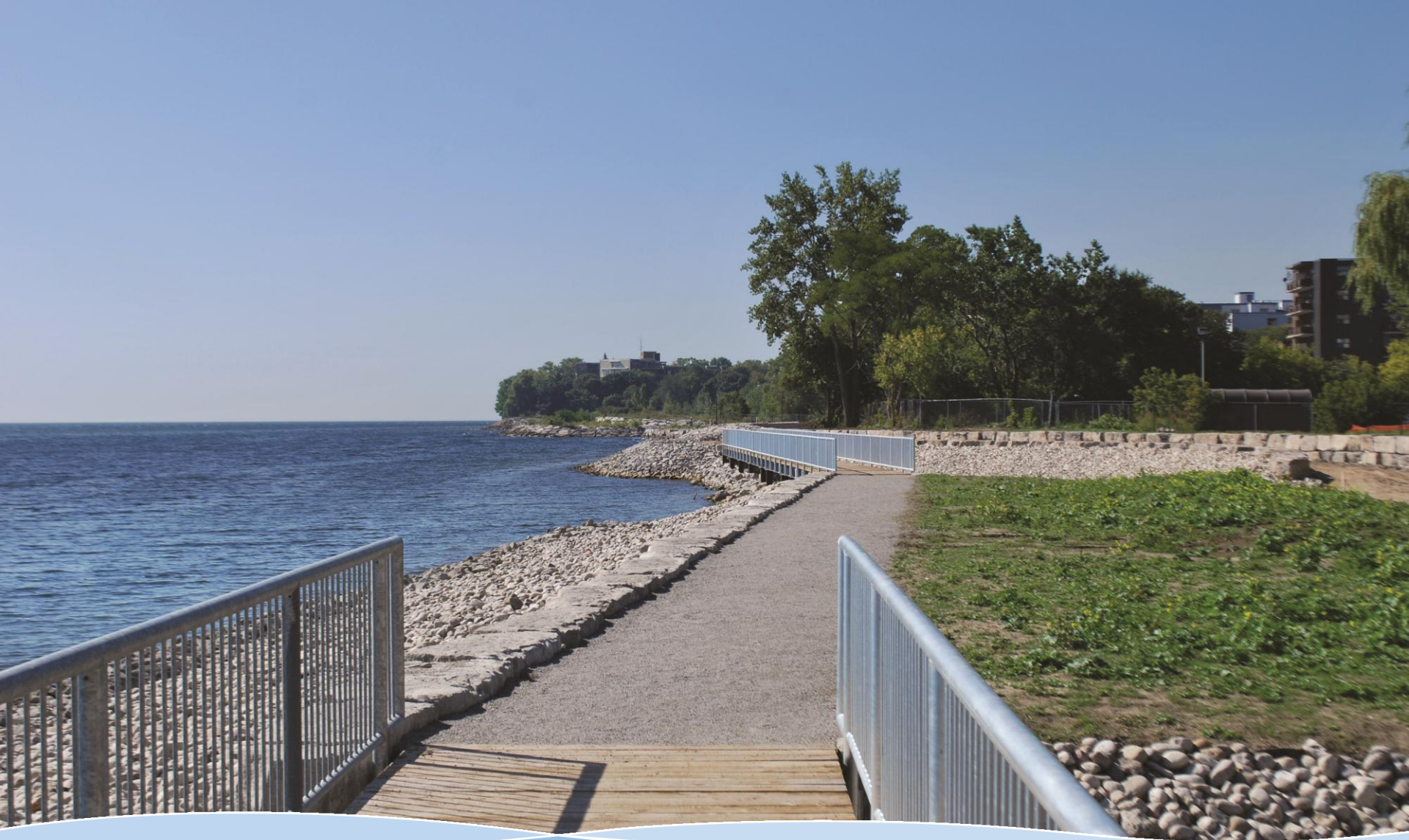
Mimico Waterfront Park