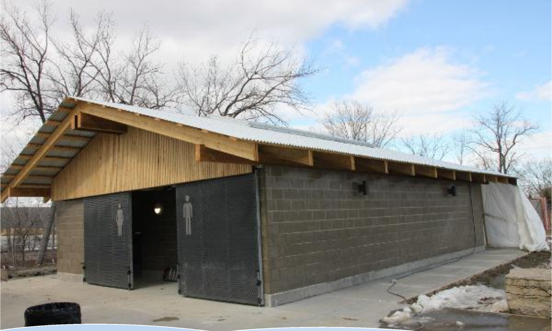
Cherry Beach Sports Field Washrooms