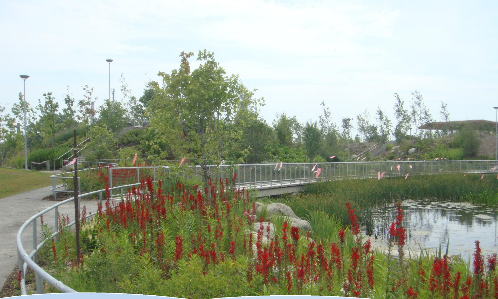
Don River Park