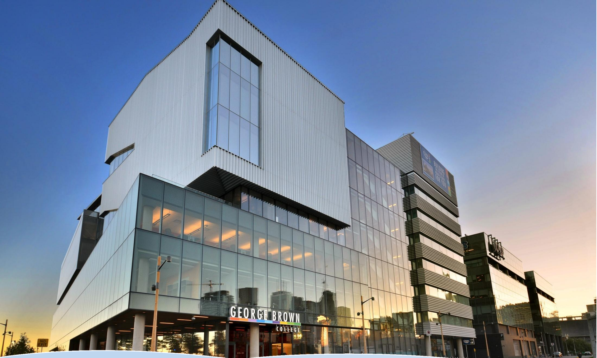
George Brown College Waterfront Campus