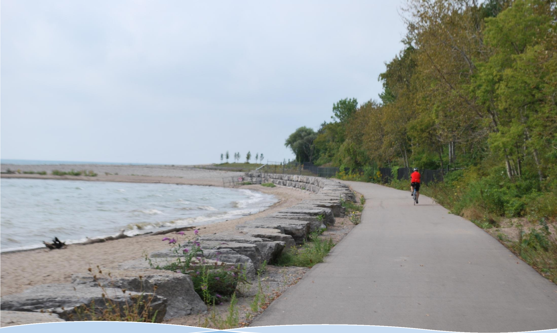
Port Union Waterfront Park