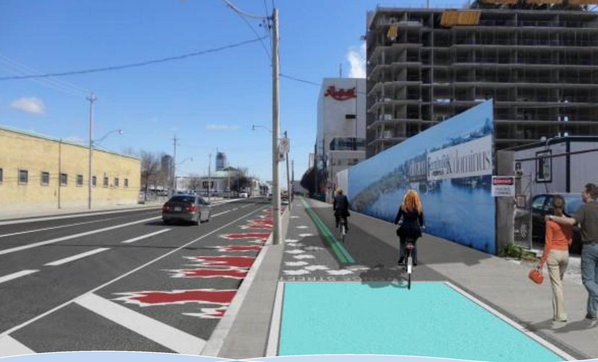
Interim Martin Goodman Trail