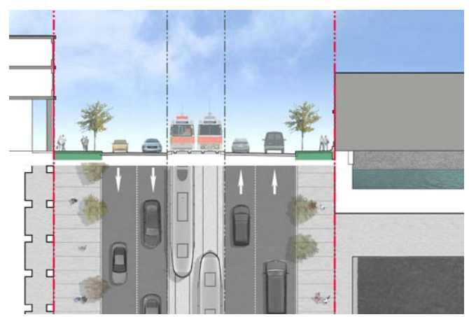
Alternative 1: Do Nothing (for Comparison Only) Maintain existing conditions