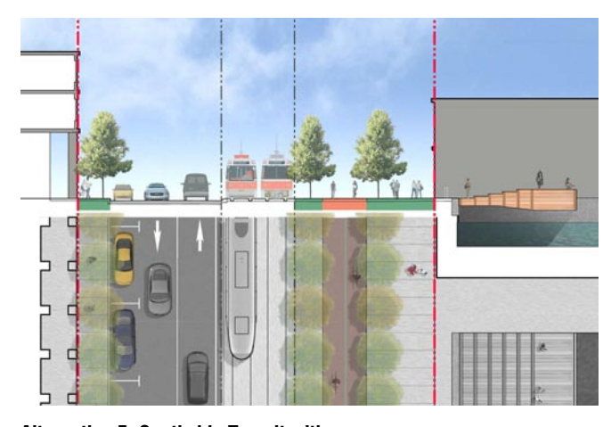
Alternative 5: Southside Transit with Expanded Public Realm and Two-Way Operations Through lanes northside for two-way traffic operations, Martin Goodman Trail southside