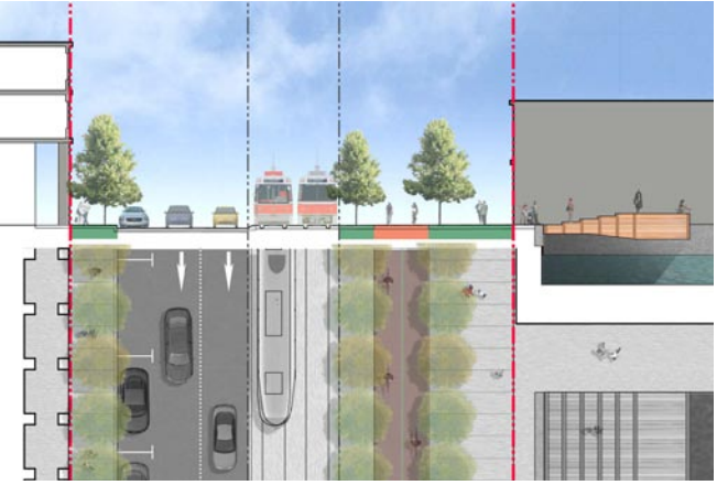
Alternative 4: Southside Transit with Expanded Public Realm and One-Way Operations Through lanes northside for one-way traffic operations, Martin Goodman Trail southside