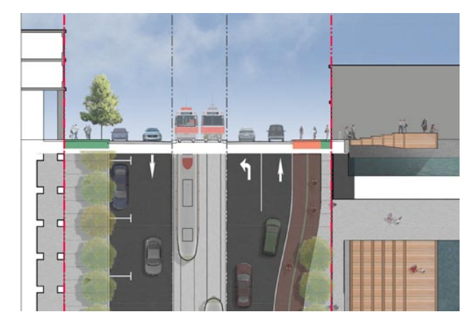
Alternative 3: Centre Transit with Martin Goodman Trail Maintain existing conditions, add Martin Goodman Trail southside