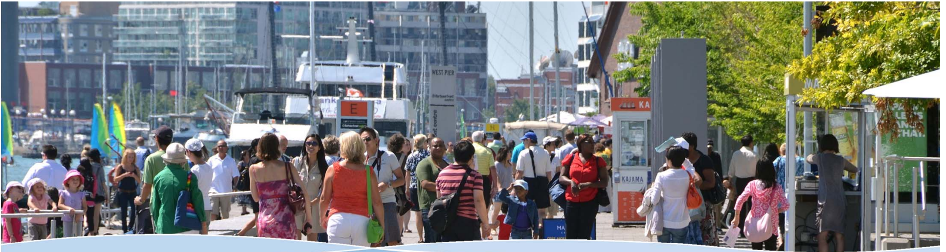
Water's Edge Promenade @ York Quay