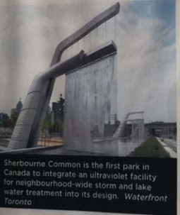
Sherbourne Common is the first park in Canada to integrate an ultraviolet facility for neighbourhood-wide storm and lake water treatment into its design.

Waterfront Toronto is the public steward responsible for leading the renewal of Toronto's waterfront. Public accessibility, design excellence, sustainable development, economic development and fiscal sustainability are the key drivers of waterfront revitalization.