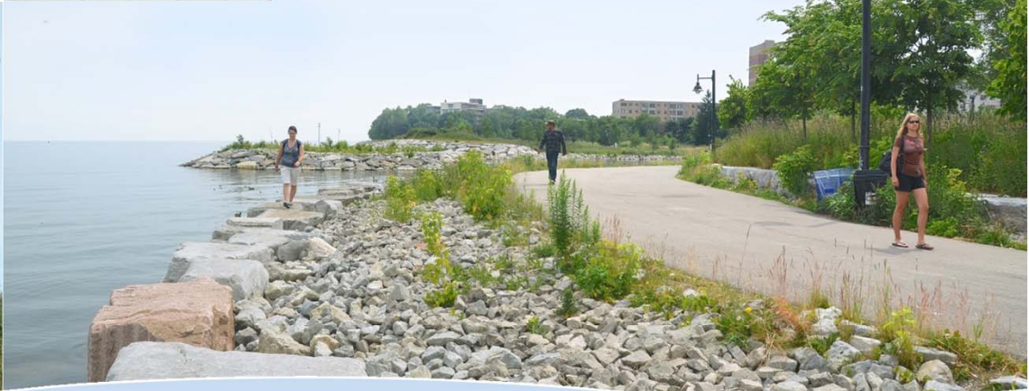
Mimico Waterfront Park – Phase 1