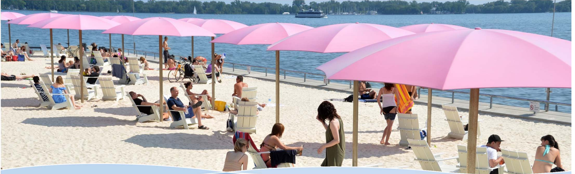
Canada's Sugar Beach