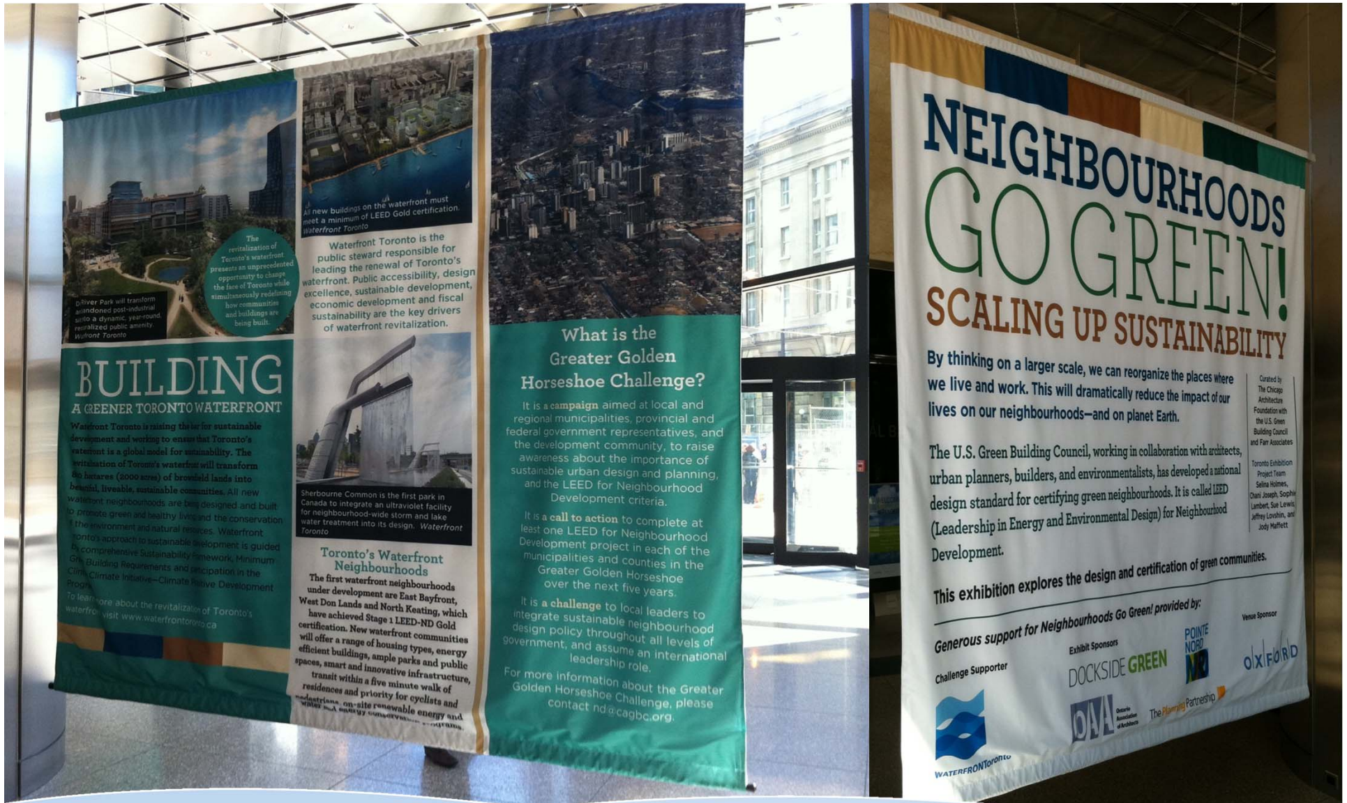
Neighbourhoods Go Green Exhibit @ Royal Bank Plaza