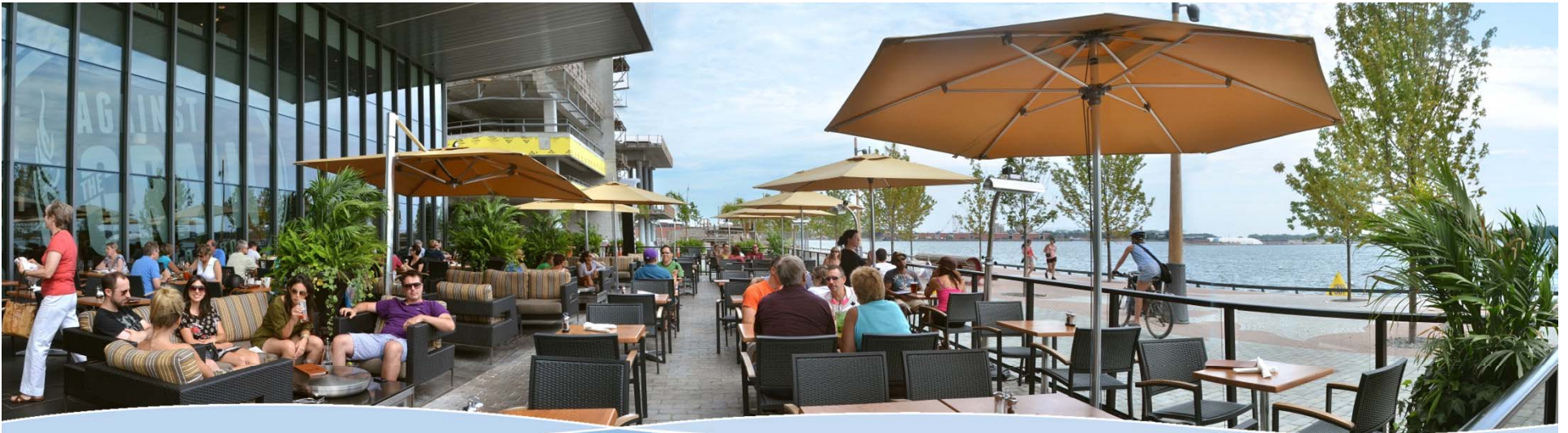
Water's Edge Promenade @ Corus Quay