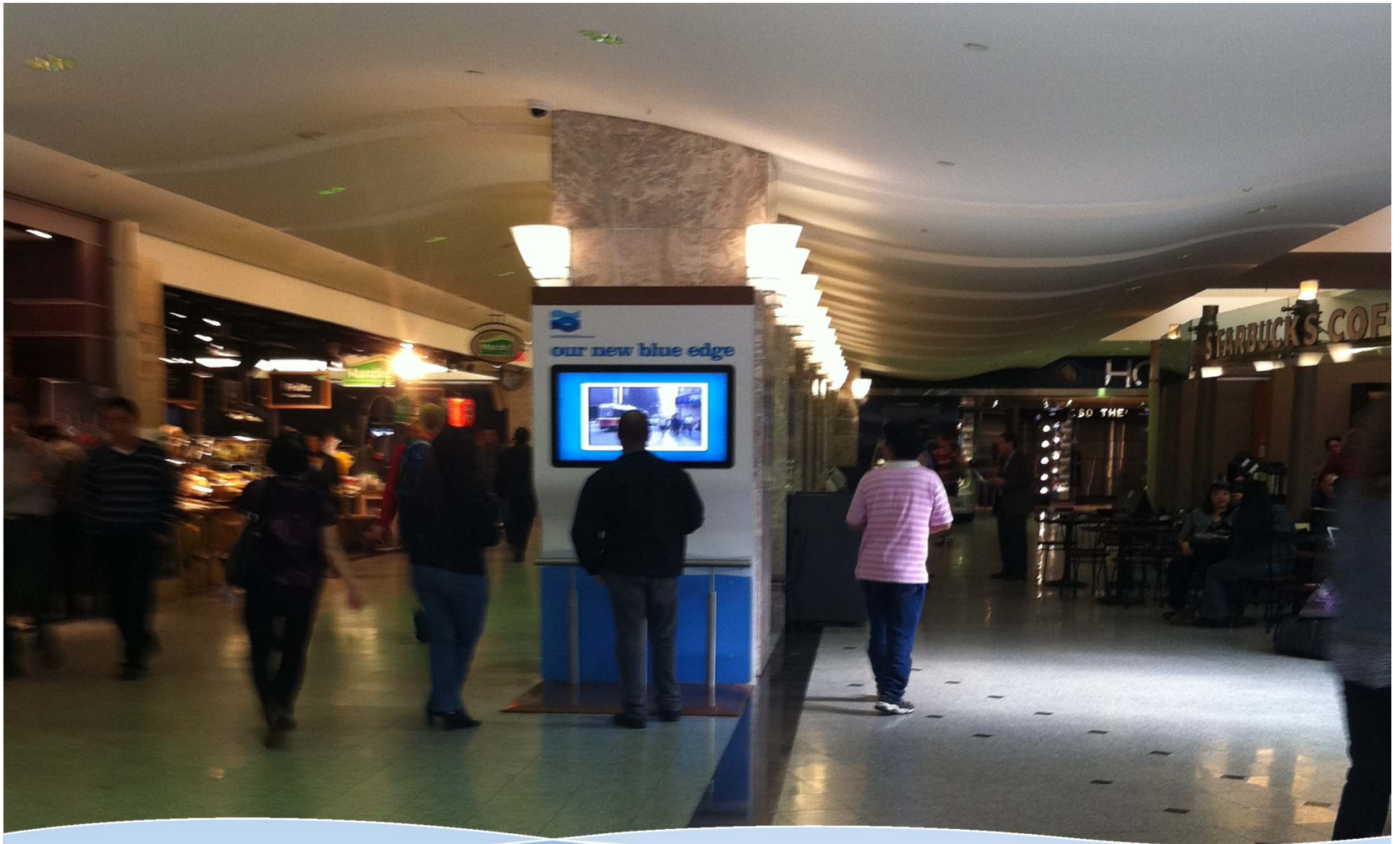
Waterfront Toronto Interactive Kiosk @ Brookfield Place