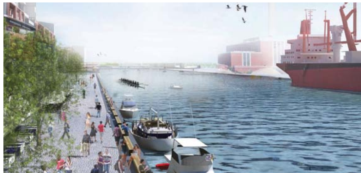
Artistic Rendering of the Ship Channel in the Port Lands