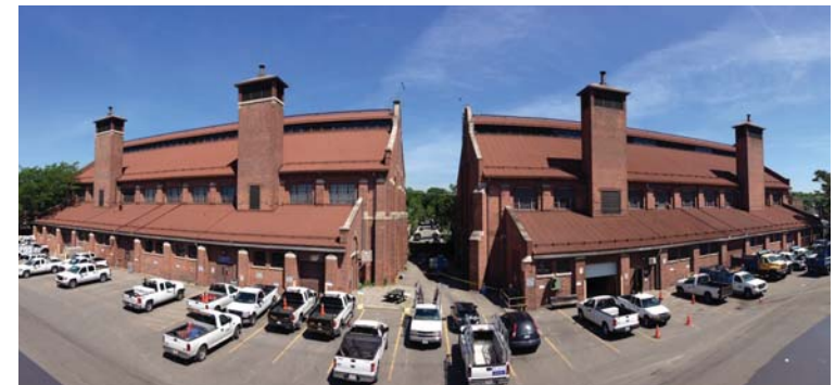
The Booth Yard in the South of Eastern Area